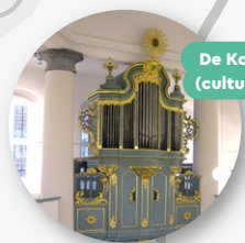
De Kopermolen (cultural centre)

This route takes you through the beautiful centre of the border town of Vaals. On your way you will pass Majestic buildings, Bloemendal castle, the fountains at the Julianaplein square , and the beautiful townhouse . You can also start this route at the tri-border point 'Drielandenpunt' , in that case follow the hexagonal signs.